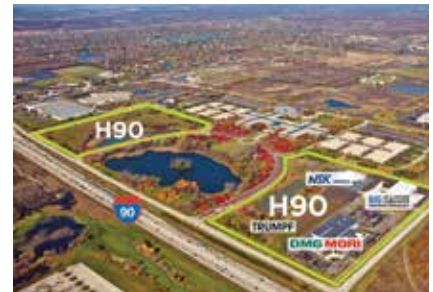
Central Road & Huntington Boulevard Hoffman Estates, IL 60192

These pro-business villages and towns are home to exceptional schools and housing. The available shopping, dining, recreation and golf courses make it an ideal location for a growing company that seeks to recruit, entertain and provide life balance.